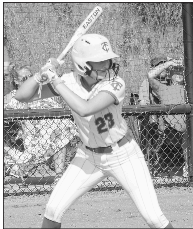
Scotlyn Fain vs. Rabun County.